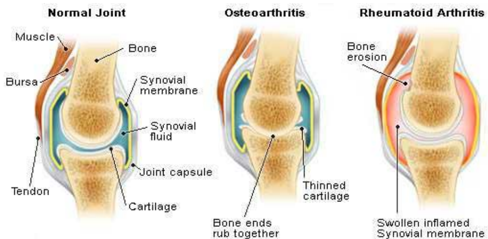
Normal and Arthritic Joints