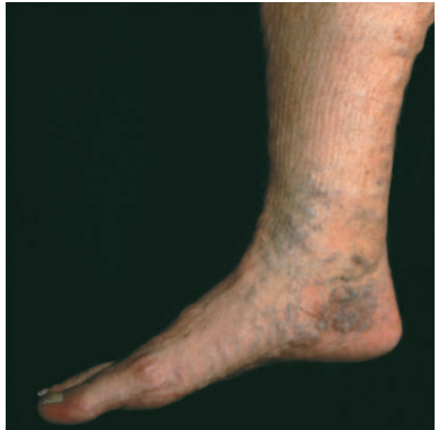
Varicose veins on a man's leg.

The predisposing causes of varicose veins are multiple, and lifestyle and hormonal factors play a role. Some families seem to have a higher incidence of varicose veins, indicating that there may be a genetic component to this disease. Varicose veins are progressive; as one section of the veins weakens, it causes increased pressure on adjacent sections of veins. These sections often develop varicosities. Varicose veins can appear following pregnancy , thrombophlebitis , congenital blood vessel